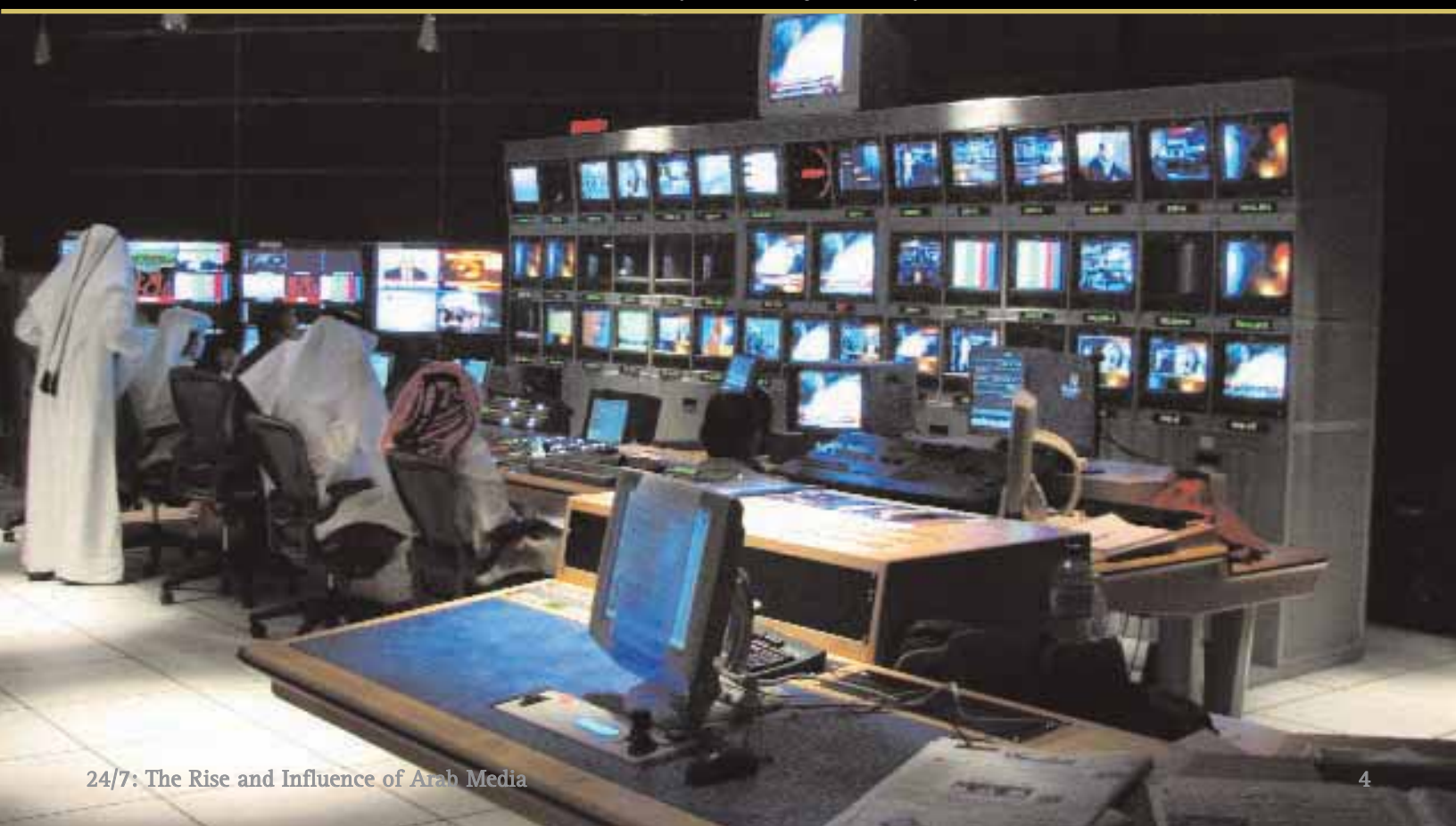
Control room at Al Jazeera station, Doha, Qatar, December 2005.

Most Americans have probably heard of Al Jazeera. Yet most of us know very little about it or the station’s many news competitors in the Arab world. Al Jazeera is headquartered in Doha, Qatar—a tiny country on the shores of the strategically vital Persian Gulf. The Gulf is also home to Al Jazeera’s main competition, Al Arabiya, a 24-hour news channel broadcasting from the city of Dubai in the United Arab Emirates.