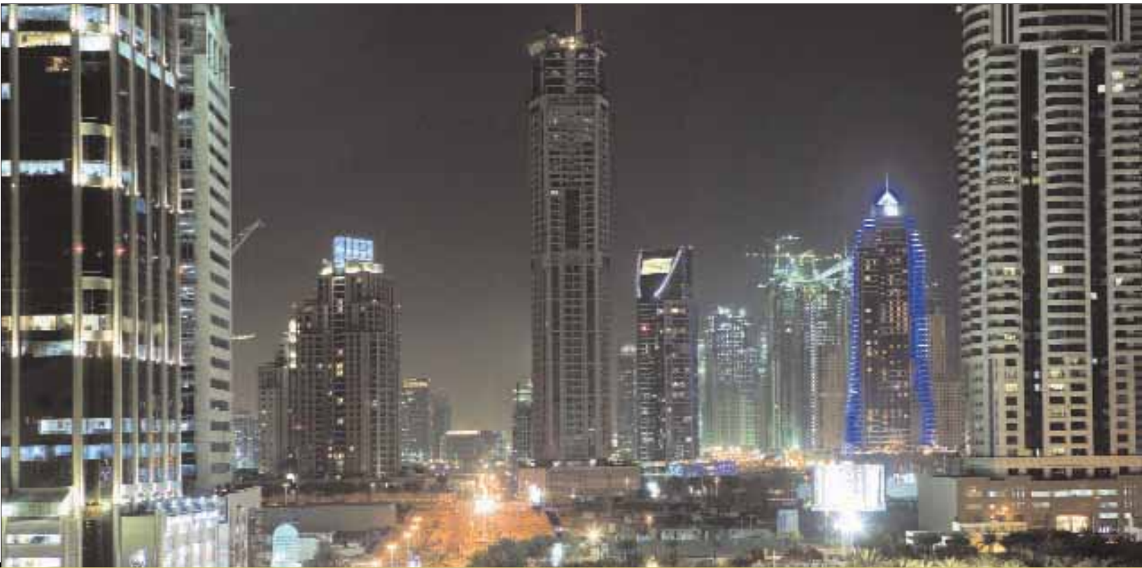
Dubai, UAE, March 2006.

To learn more about this photography project and the radio documentary special “24/7: The Rise and Influence of Arab Media,” visit the special Web feature from the Stanley Foundation: “Security in an Era of Open Arab Media,” www.stanleyfoundation.org/initiatives/oam , containing a wealth of resources including original articles, expert interviews, in-depth policy analysis, photojournalism, and material from the public radio documentary.