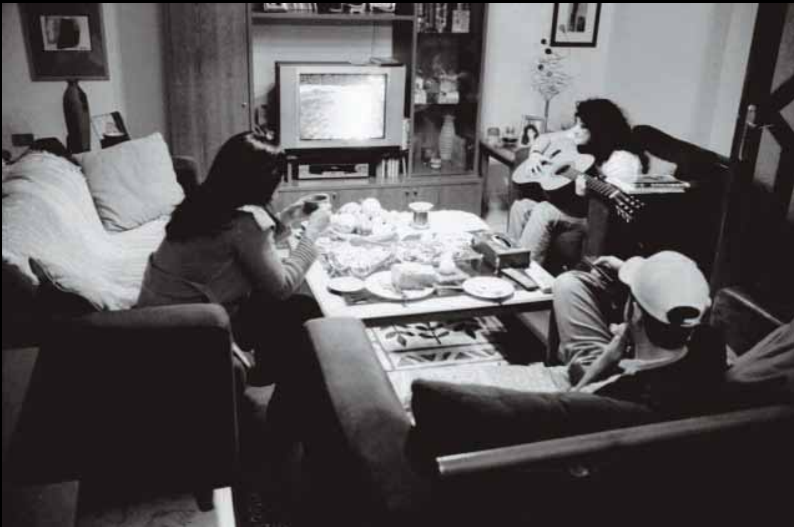
Single mother watches television with her children. Beirut, Lebanon, March 2006.